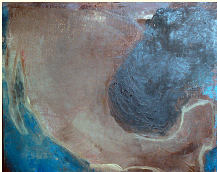
"Mexico" Oil, canvas 6"x 8" 1985