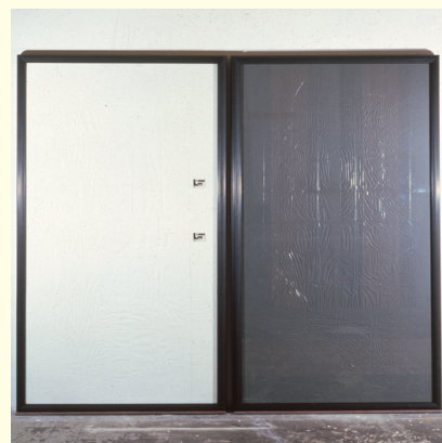
"Seamless" w/detail Encapsulated photographs, plastic bags, frame, glass 84"x80" 1988