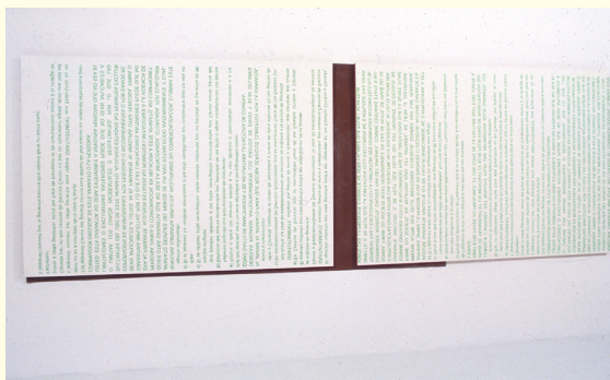
"Warranty" Screen ink, enamel, honeycomb panel, aluminized rubber 1988