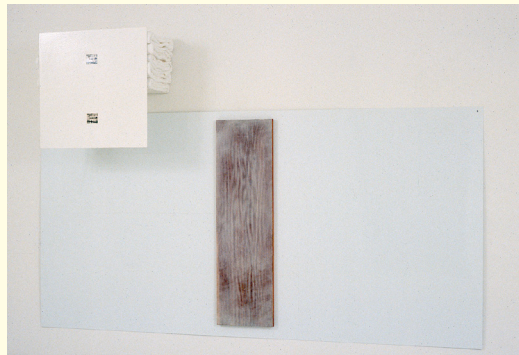
"Outrigger (St Louis World Fair 1904)" w/detail Encapsulated photographs, beeswax on wood veneer on mahogany, aluminum, cotton, enamel 96"x 72 x 16" 1987