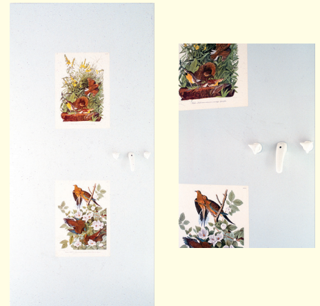
"Fountain" w/detail Audubon reproduction print, faucet, aluminum 96"x 48" 1987